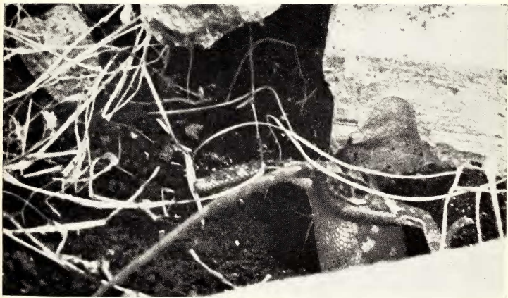
2. Female digging pit with forelimbs